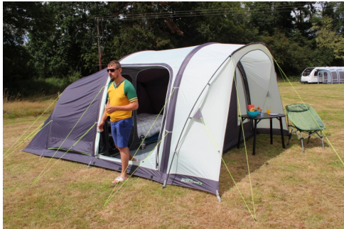
Cruiz 6.0EX Outer Height: 215CM Inner Height: 205CM